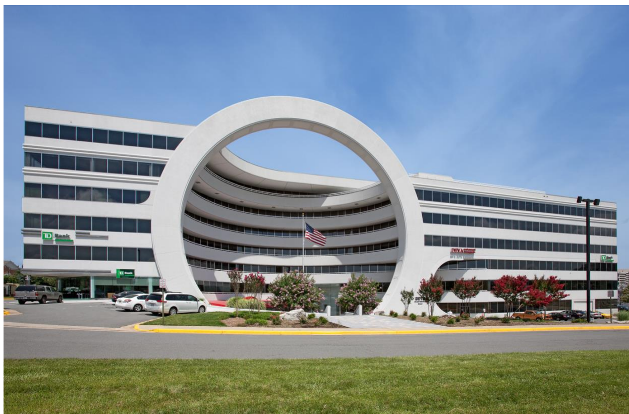
VUST Campus Building-Suite G100

VUST's official Contact info is: Tel: +1-703-880-8446, Fax: +1-703-880-8728, and contact email: info@VUST.edu