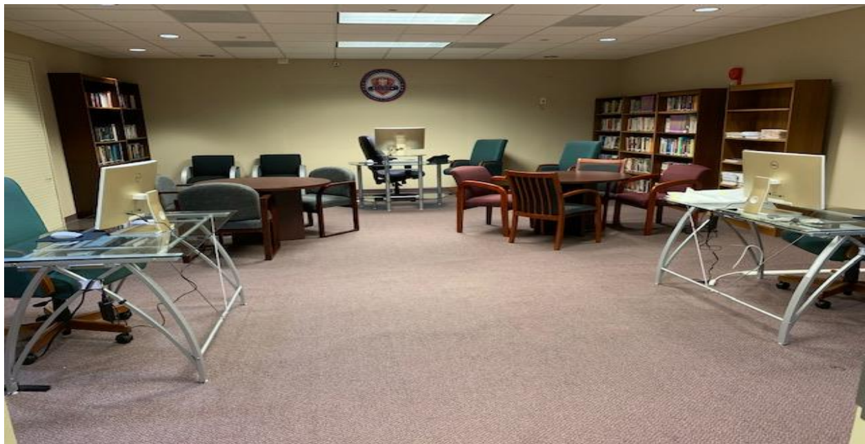
VUST On-Campus Library