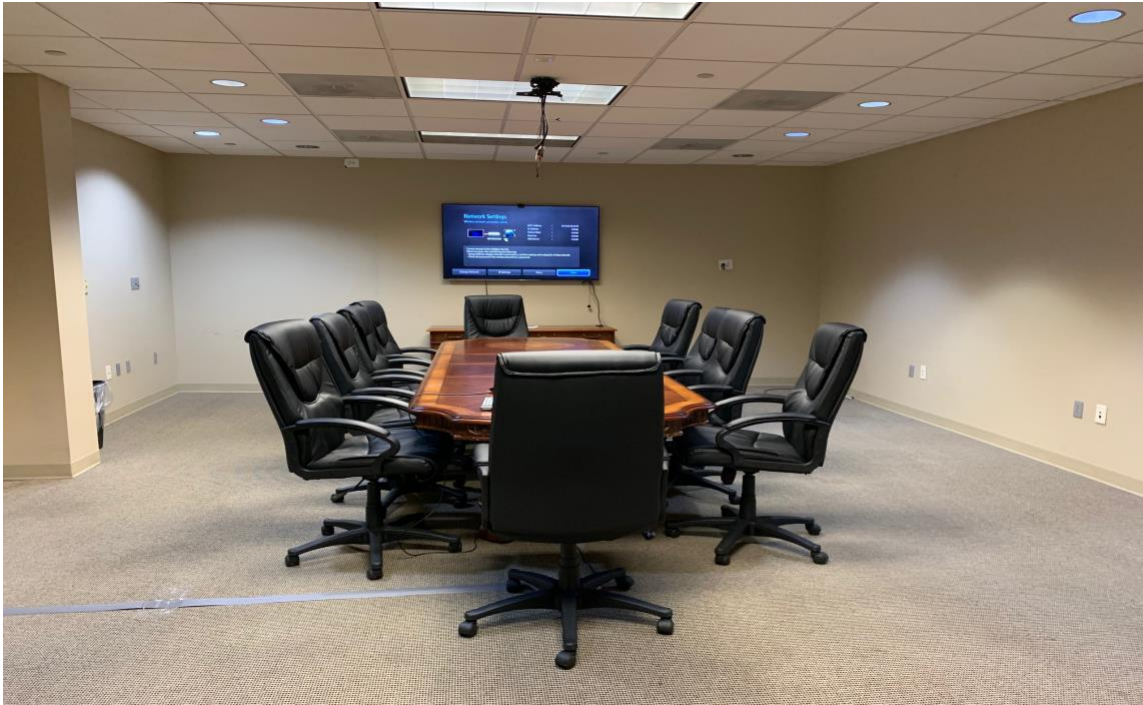
Conference Room & Distance Learning Center